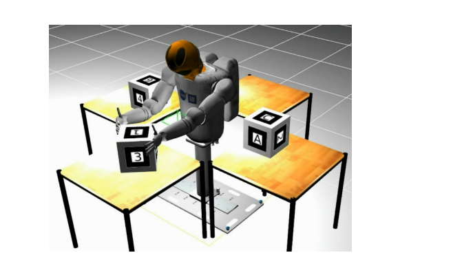
Fig. 2. The simulated Robonaut 2 interacting with an ARcube.

random and presented to the robot. The robot observes the object and executes an action. This process is repeated 20 times. At the end of each trial the robot determines the likelihood that the presented object is novel and the most likely existing object in memory is identified.